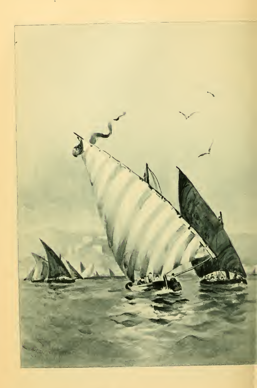
With broad wings poined.